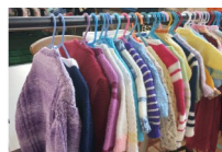
Baby Box and Ventnor Community Pantry opening hours: Tuesday 3-6 Saturday 10-1