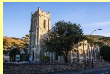
St Catherine's Church, Ventnor