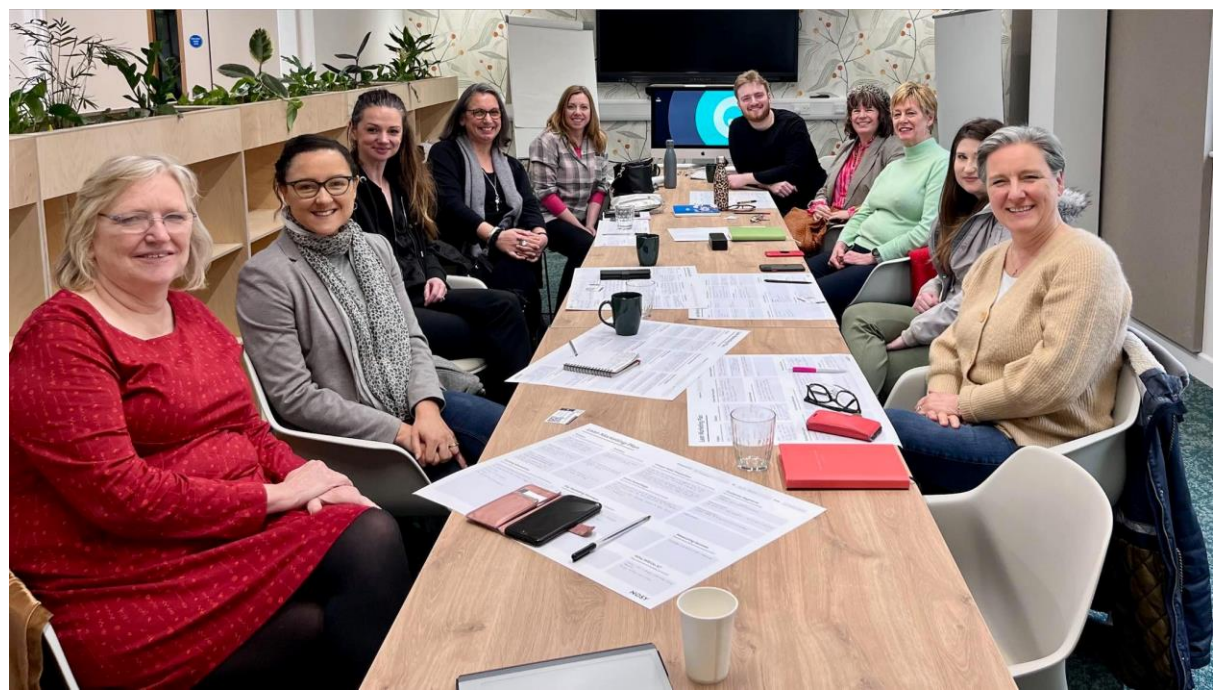
Go for Growth provides free business advice and specialist support to the owners of independent businesses, in any sector, based on the Isle of Wight.

Local business owners can join the Hub for free here: <a href="https://go-for-growth-business-hub.mn.co/">https://go-for-growth-business-hub.mn.co/</a> and can request a free online 1:1 business health check with a Go for Growth advisor. Following this there is the option to join a series of online and in-person workshops relevant to their organisations' needs and goals led by local specialists.