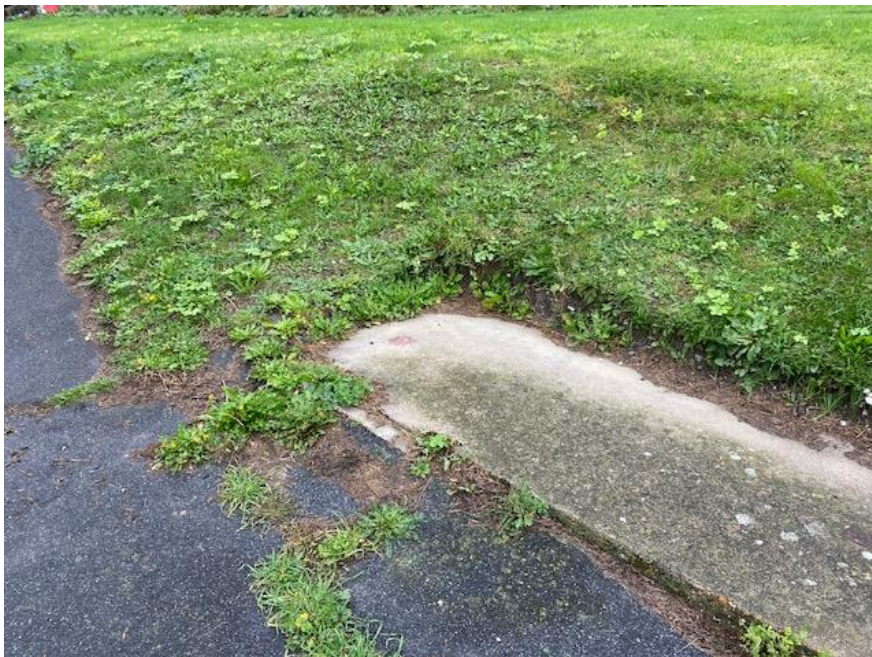
Concrete Bases, ready to refurb for remembrance benches

There are a couple of existing concrete bases which need tidying around and will then again make excellent bases for remembrance benches.