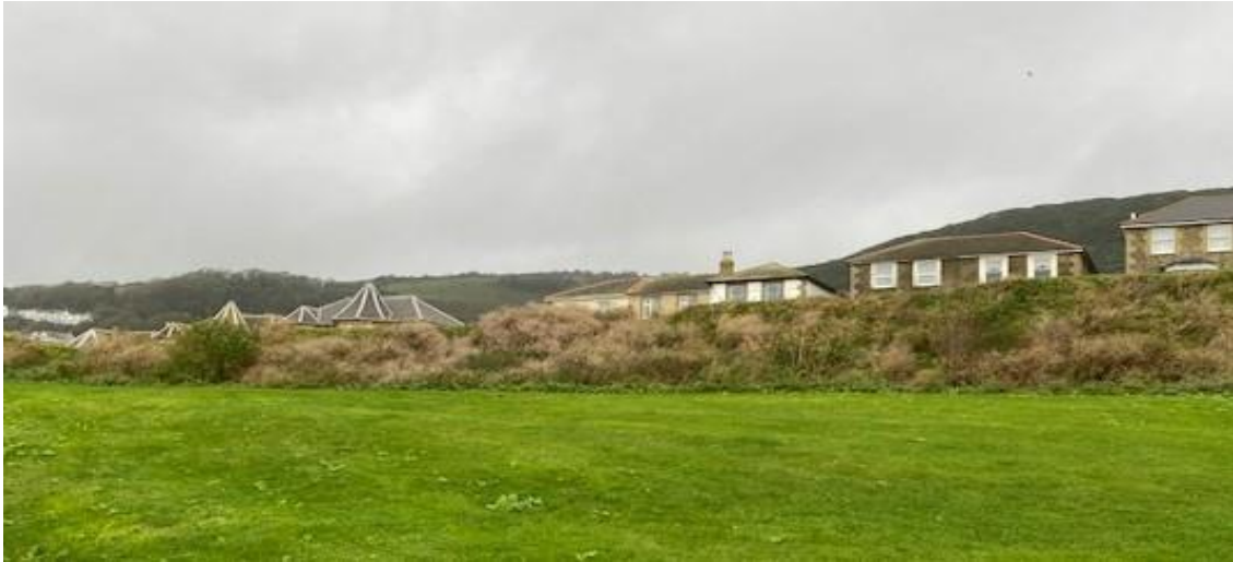
The banked area on the gardens, requiring a cut back