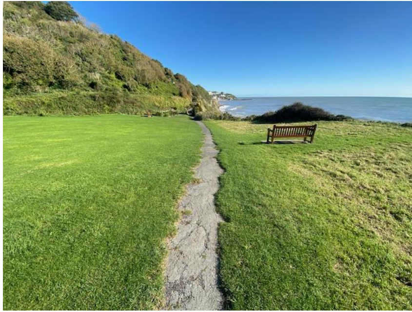
Path shrinkage due to overgrown edges