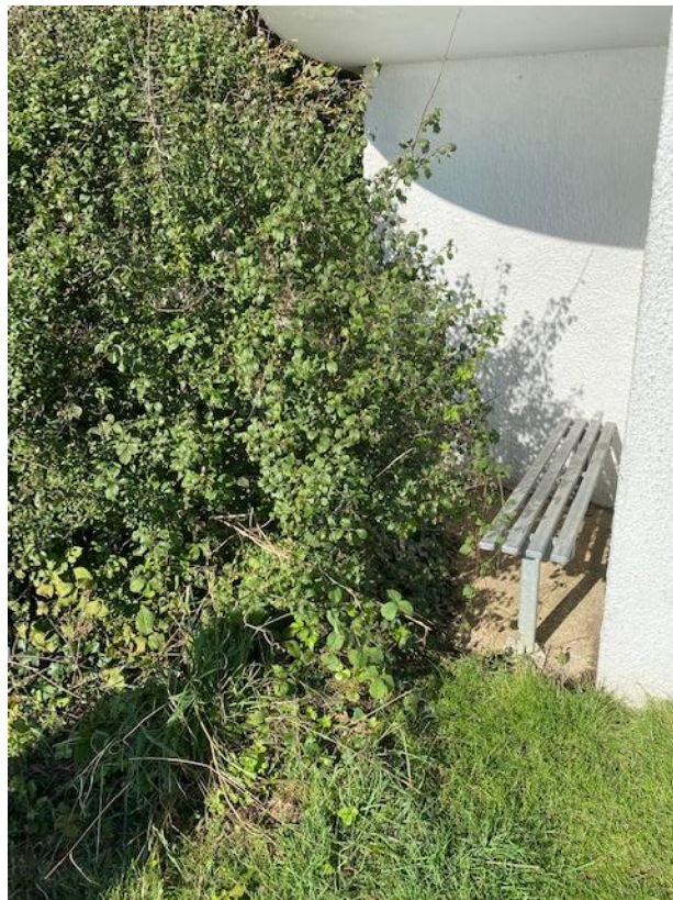
1.75m safe clear area needed

This area of the cliffs is maintained and managed very well. Some areas need to be monitored to ensure that they are up to the required needs of the area, including the rewilding areas near to the cliff edge. One note to add again is the shrinkage of the path widths, these need to be retained at the safe size for ease of walking and for people with mobility issues, wheelchair users and buggies. There is an amount of overgrowth around the benches which need to be trimmed back to the 1.75m safe area, along with the area beside the viewing hut side bench and barbeque area, again 1.75m safe area.