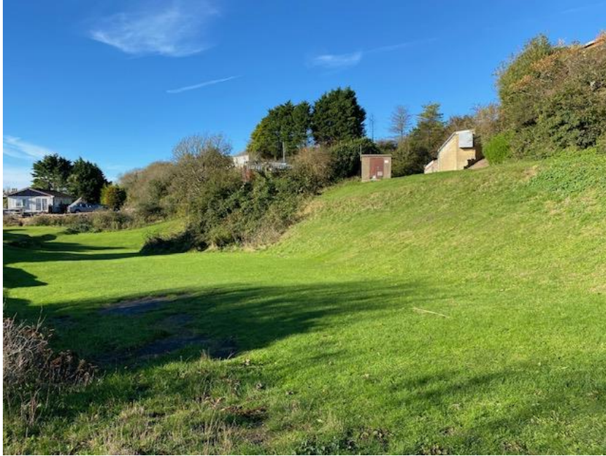
Area behind the small Industrial units