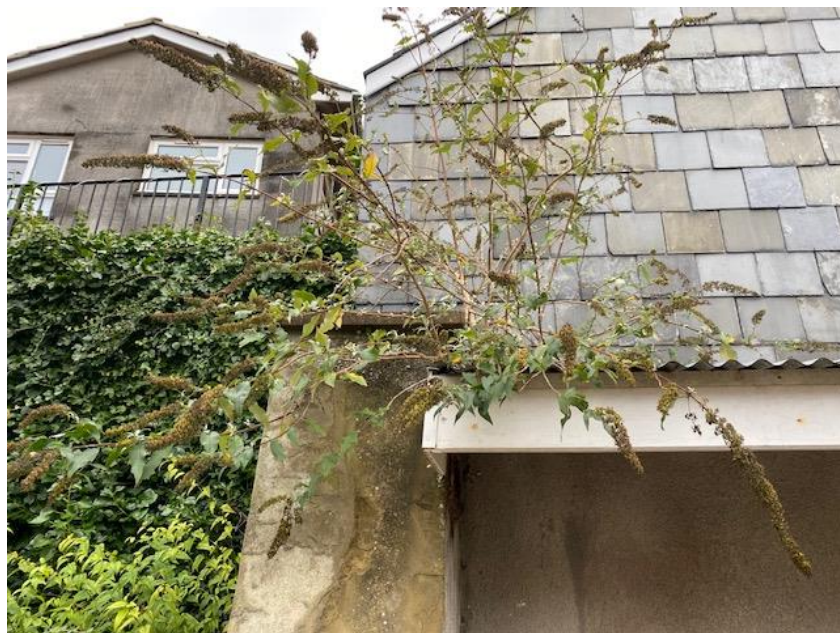
Buddleia bushes damaging the shelter