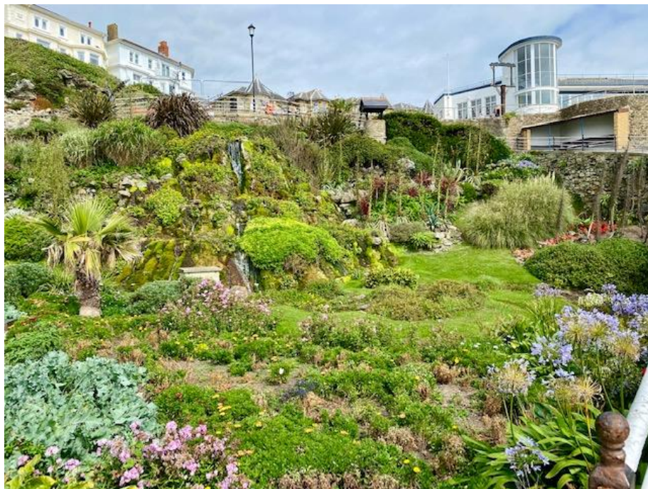
The Cascade Ventnor