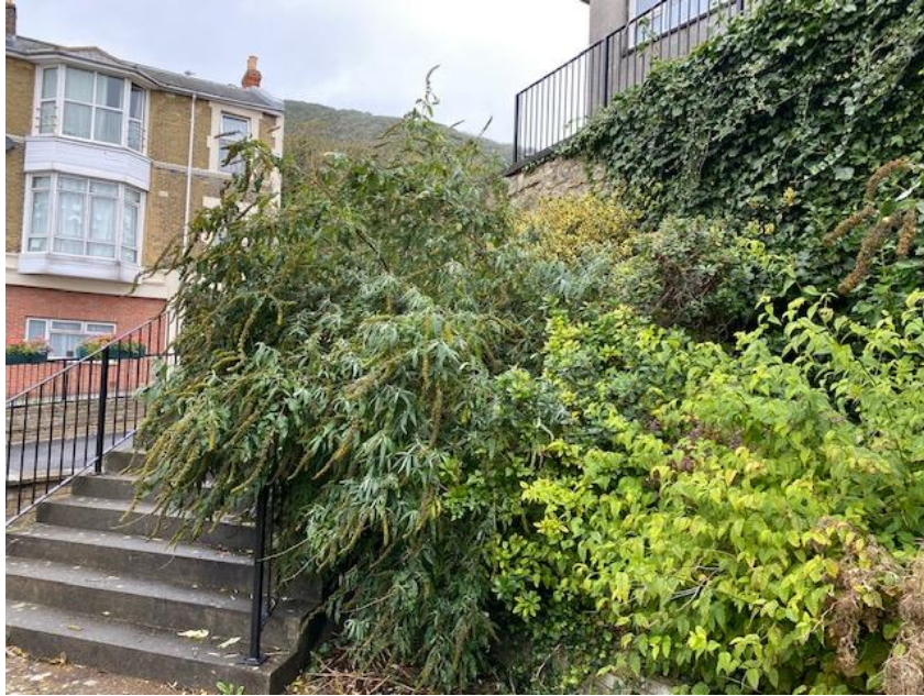
Badly overgrown Buddleia Bush