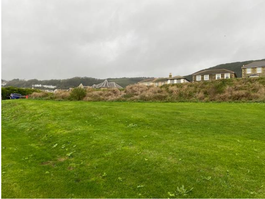
The Bank, which is infested with rats, needing to be cut back

There are a couple of existing concrete bases which need tidying around and will then again make excellent bases for remembrance benches.