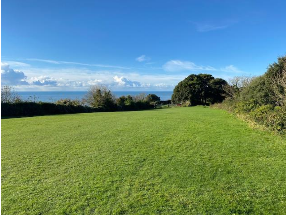
Upper green area