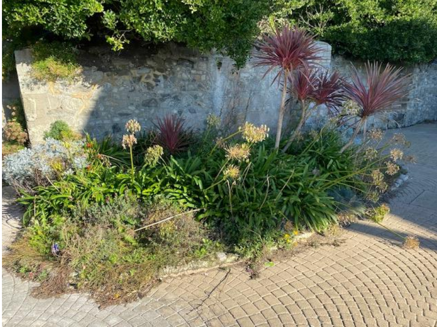
Planter areas near the cascade in need of tidying