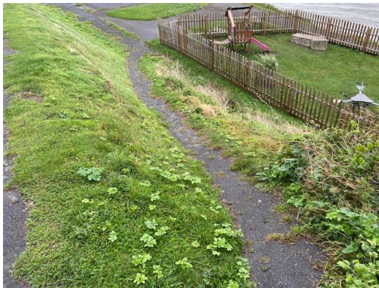
Overgrown pathway areas. This was in fact once over 900mm wide.