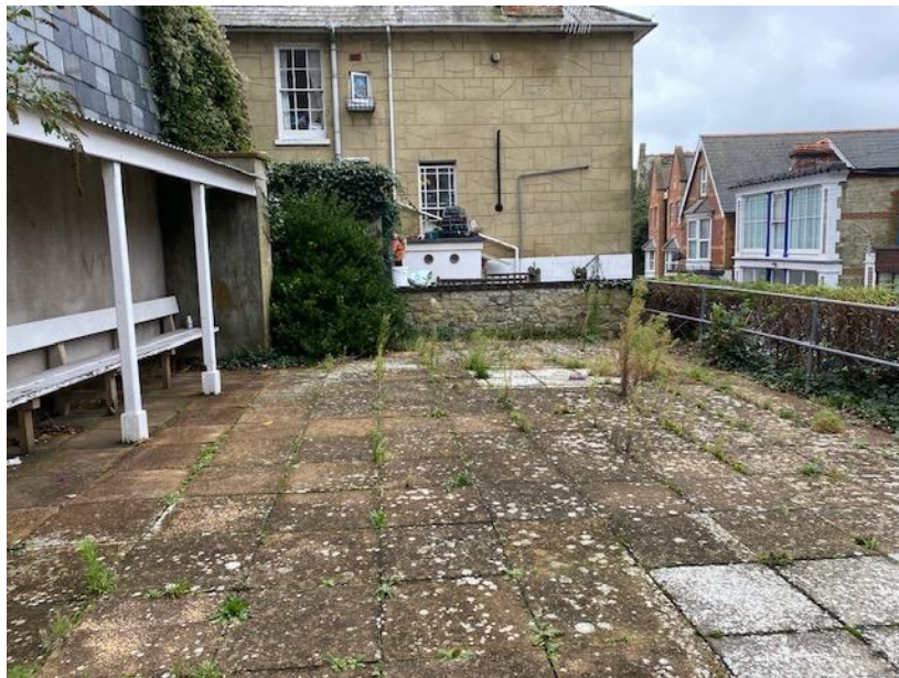
The corner area is very unkempt, and requires upgrading

The shelter itself is the responsibility of the IOW Council. An approach is being made for them to enhance the appearance of the shelter and repair the roof.