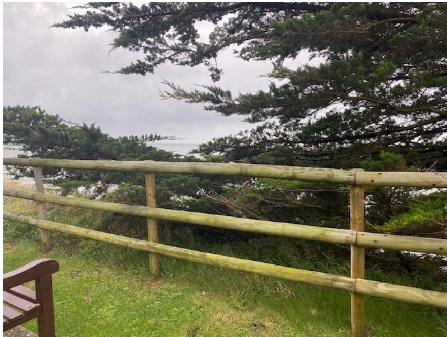
The obstructed view of the bench area, needing cutting back