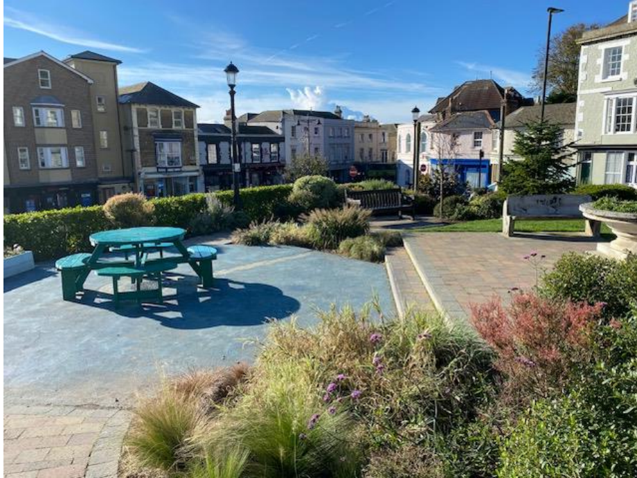
Springhill Gardens Picnic Seating area