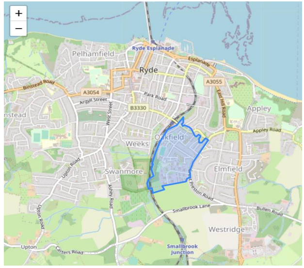
Ryde: St Johns B