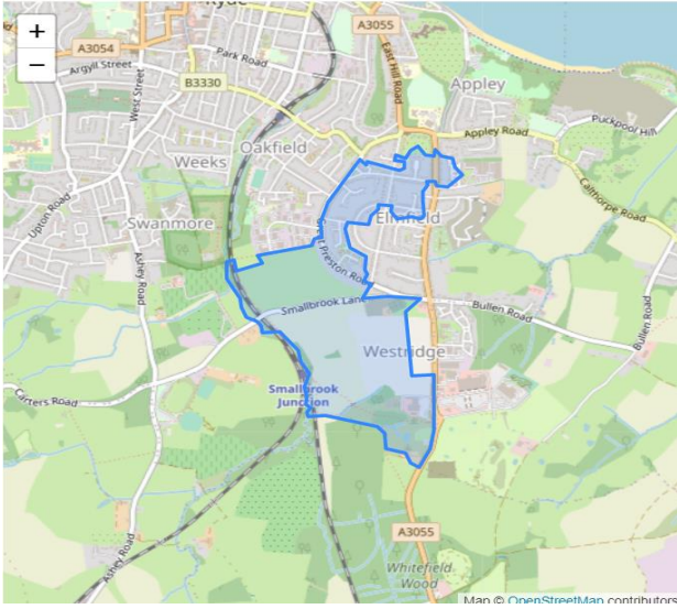
Ryde; St Johns A