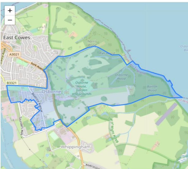
East Cowes: Osborne North