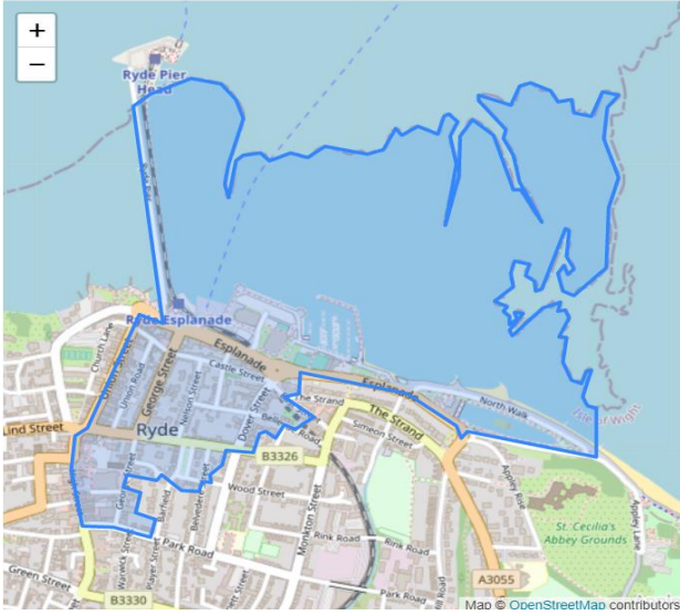
Ryde: Ryde North