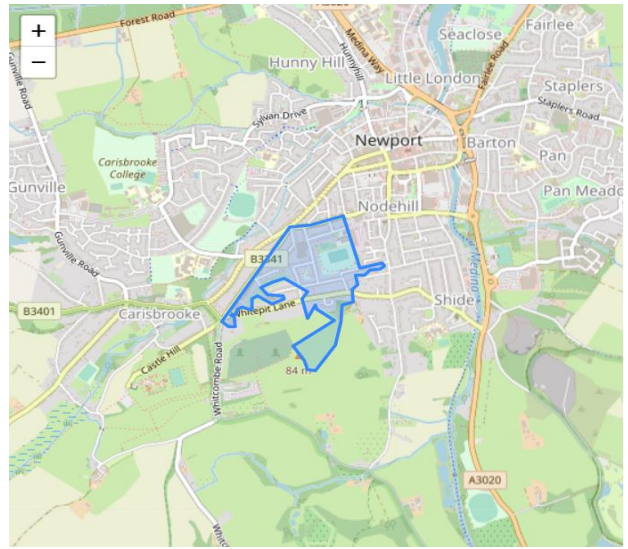
Newport: Mount Joy B