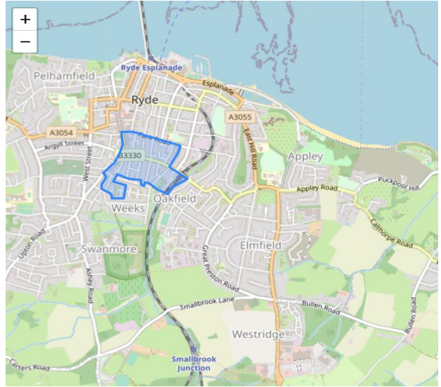
Ryde: Ryde South