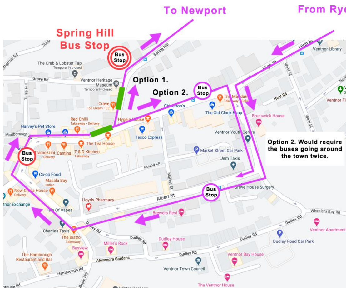
Fig. 2: No. 3 buses travelling from Newport to Ryde.

The No. 3 route shown in Fig. 2 below on the other hand is problematical. The buses come into Ventnor from Ryde via Lesson Road, past Trinity Church and into the top part of Ventnor High Street. Pass down Victoria Street past the surgery bus stop and then on to the bus stop outside Boots. Buses then travel through Ventnor High Street, up Spring Hill turning left on to Boniface Road and onward to Newport. It is an efficient route outside of the restrictions of social distancing.