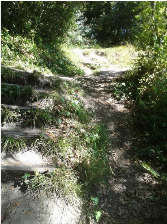
Step route before remedial work