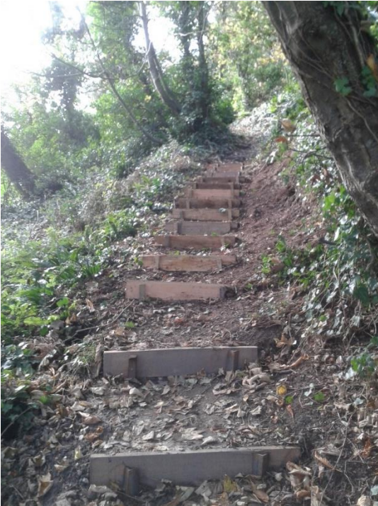
New steps on slopes