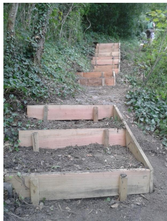
Step route after remedial work